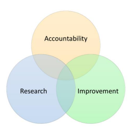
Figure 2: The three faces of performance measurement<sup>9</sup>

Dr. Grimshaw also discussed Brehaut's 15 suggestions for optimizing effectiveness (of implementation) from among the themes of: nature of desired action, data available, display of data/results and delivery of interventions as a guide for effective implementation.<sup>15</sup>